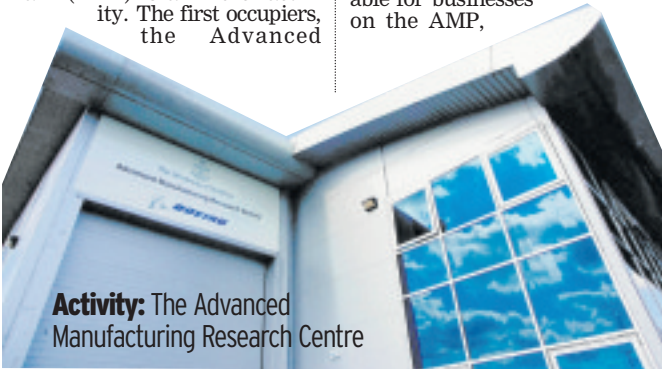
Activity: The Advanced Manufacturing Research Centre

These developments in industrial and physical regeneration will proudly show the world that they were 'Made in Sheffield.'